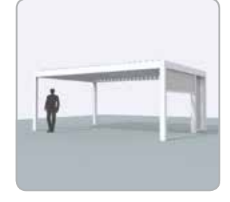
Pivot and/or frame side* equipped with integrated Fixscreen® and sliding door by means of Loggiascreen® 4 fix