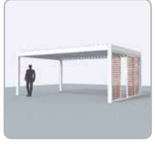
Frame side* equipped with Loggiawood®