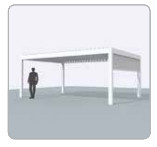
Frame side* equipped with integrated Fixscreen®