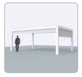
Combination of several integrated Fixscreen®