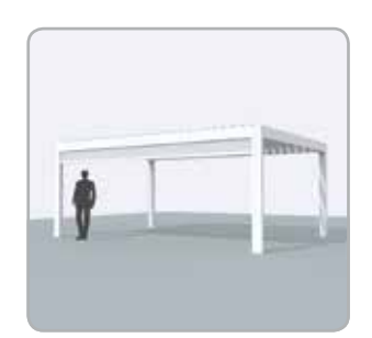
Pivot side* equipped with integrated Fixscreen®

Elegant sliding panels with windtight screens or wooden blades are another option. Wood is back again and is easy to combine with other materials.