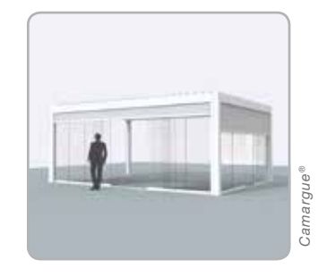
Pivot and/or frame side* equipped with sliding glass panels in combination (optional) with integrated Fixscreen®